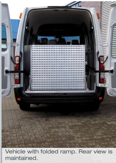
Vehicle with folded ramp. Rear view is maintained.