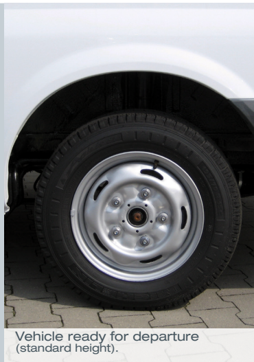
Vehicle ready for departure (standard height).