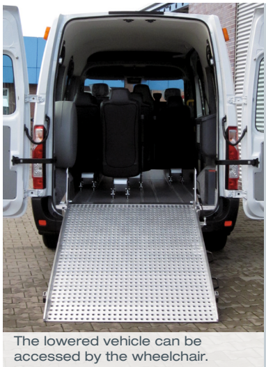
The lowered vehicle can be accessed by the wheelchair.